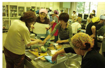
▲ Cook vegetables

Course Sapporo → Farmers' vegetables market → Harvest local food (ex. Strawberries, Blueberries, Corn, Melons etc.) → Cooking & Lunch → Japanese health lecture → Sapporo