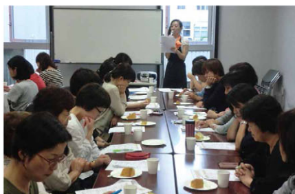
▲ Japanese health lecture